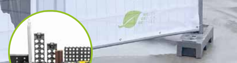
CONSTRUCTION AND INDUSTRY

Not every type of plastic is suitable for straight-line recycling into new pallets, boxes or waste containers. Nevertheless, our certified recycling partners with their reliable know-how offer many known and less known possibilities for this with the use of various post-consumer mixing residues, PET and PVC recyclates.